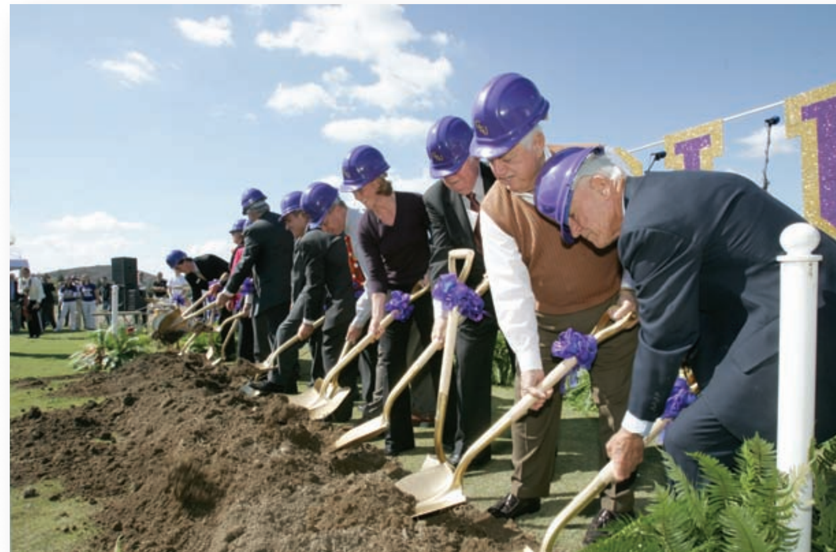
Groundbreaking ceremonies for the North Campus in 2004.