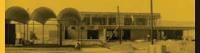
Construction of the first buildings on campus got underway in 1961.