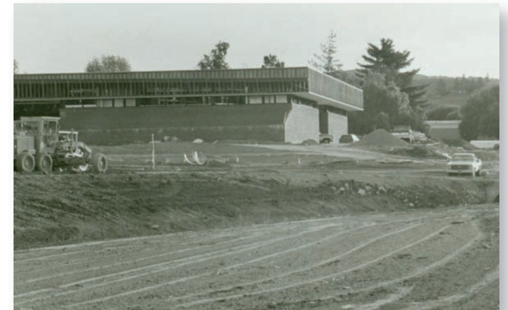
Construction of the Pearson Library and Preus-Brandt Forum in 1984.