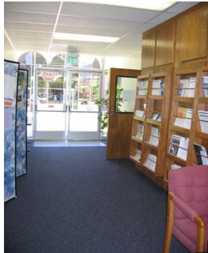
More renovation pictures of the ADEP Hallway